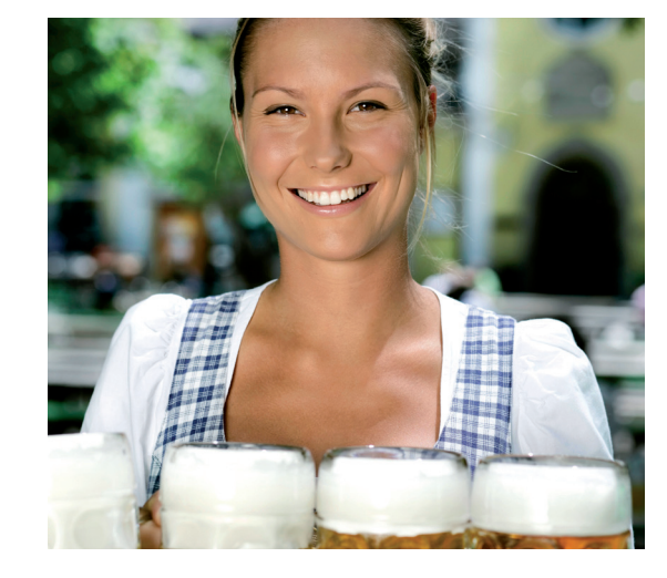
Temporary work. It doesn't have to be forever. Working in the weeks or months leading up to your studies brings two benefits. One: you earn some extra cash. Two: you gain valuable life experience.

Safety in the workplace: a top priority.