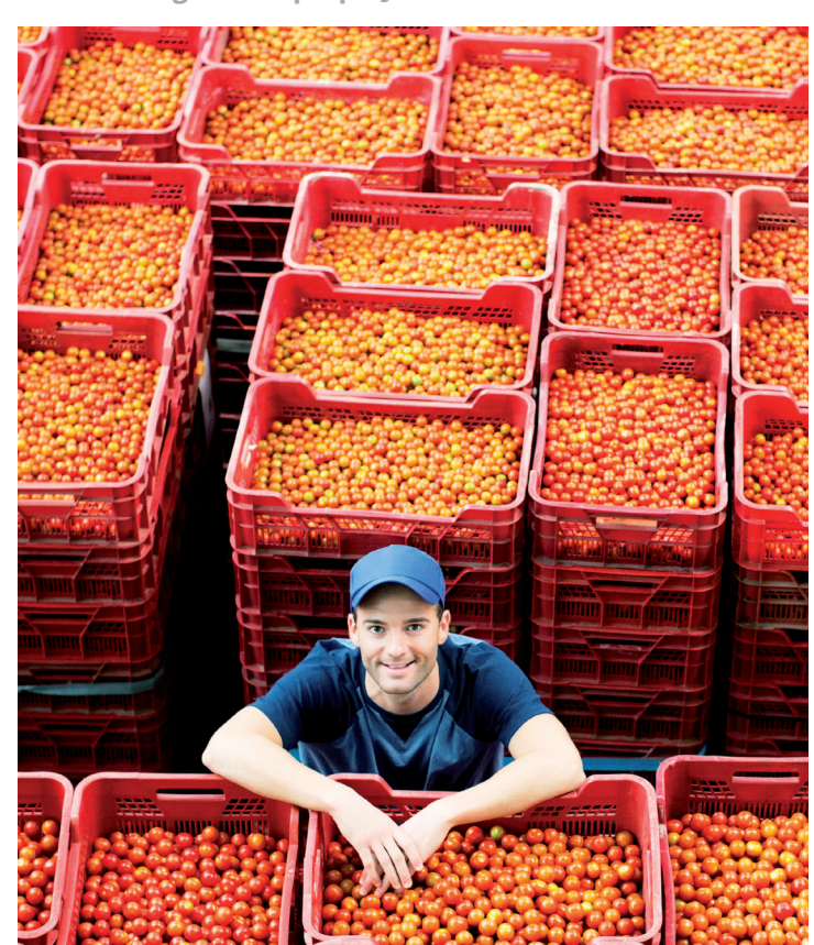
Temporary work. Less theory. More practice. Don't get trapped inside your head – take on a temporary job that focuses on the practical side of things. A change of scenery can give you new ideas on where to go next.

Temporary work. Talented professionals wanted. Take courses to further hone your knowledge and skills. temptraining can help you with the financial side of things.